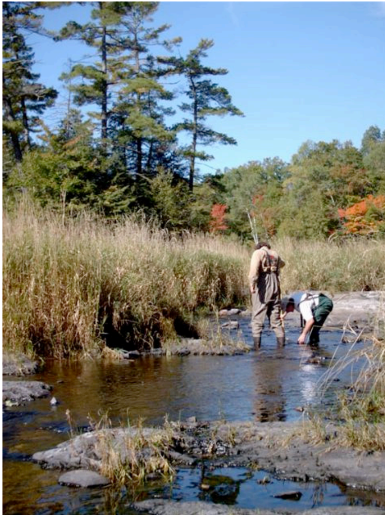
Benthic sampling above Jackson Falls